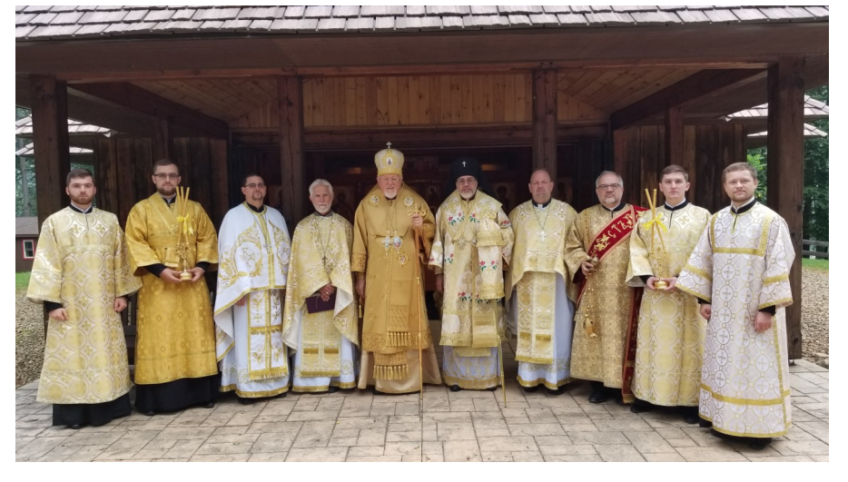
(Convention - continued from page 5)